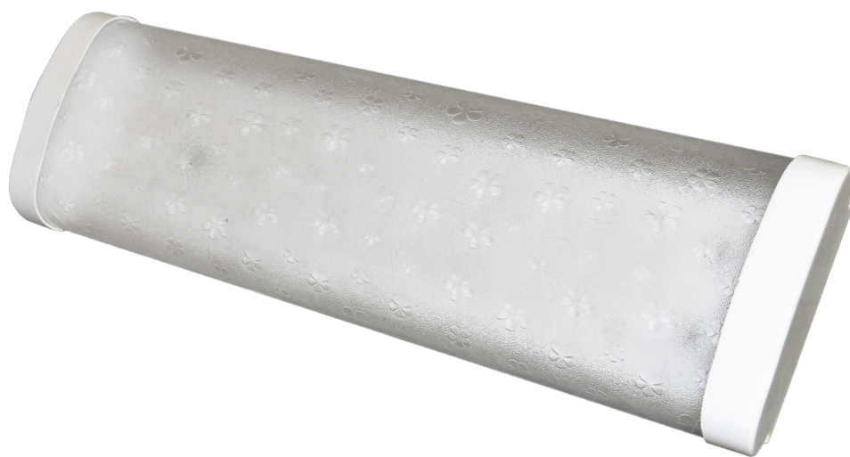
WRR HM LED IP40